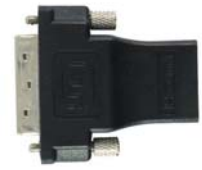
DVI to VGA converter